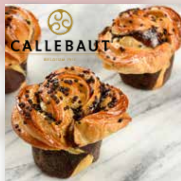
Chocolate Covered Waffle Bites, page 14