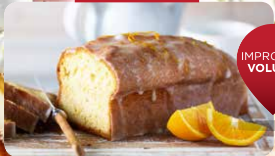
Complete Sponge Cake