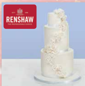
New Renshaw Ready to Roll Modelling Paste, page 18