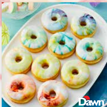
Fantastic American donut mixes range for exciting sweet bakery offerings, page 29