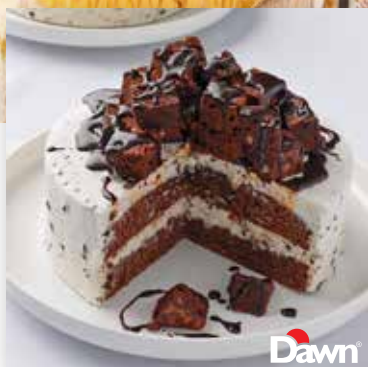
Delicious American Cake Mixes for creating eye-catching seasonal bakes, page 29