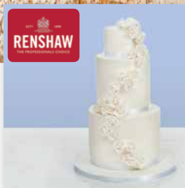
New Renshaw Ready to Roll Modelling Paste, page 19