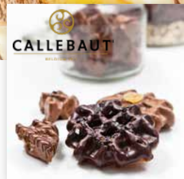
Chocolate Covered Waffle Bites, page 14